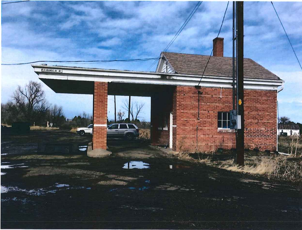
Attachment E (Figure 4) – 5DV.9371 (Combined Filling station and Oil House) looking north