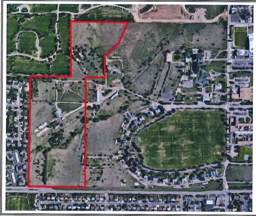
Attachment B: Map of Proposed 66 Acre Acquisition Parcel (project site)