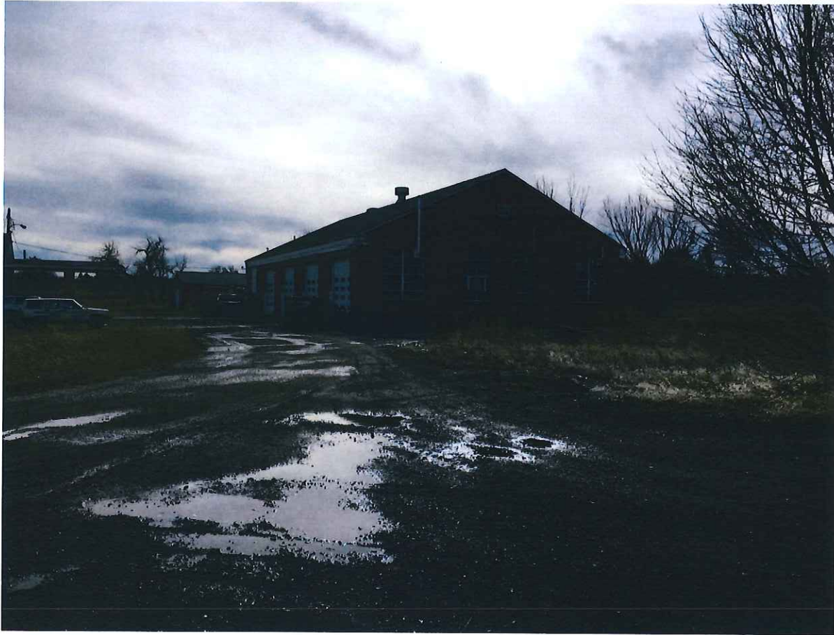
Attachment E (Figure 3) – 5DV.9421 (Building 64, Garage and Repair Shop) looking south