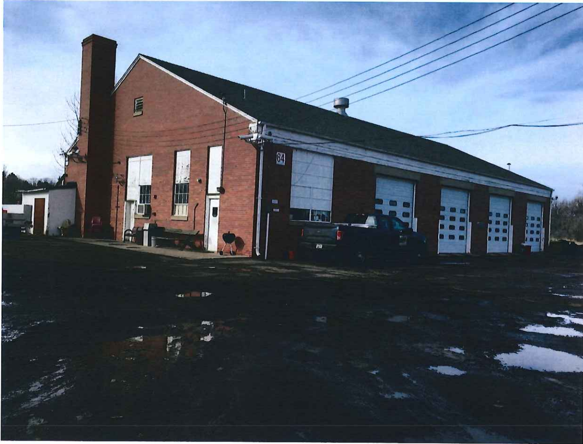
Attachment E (Figure 2) – 5DV.9421 (Building 64, Garage and Repair Shop) looking northwest