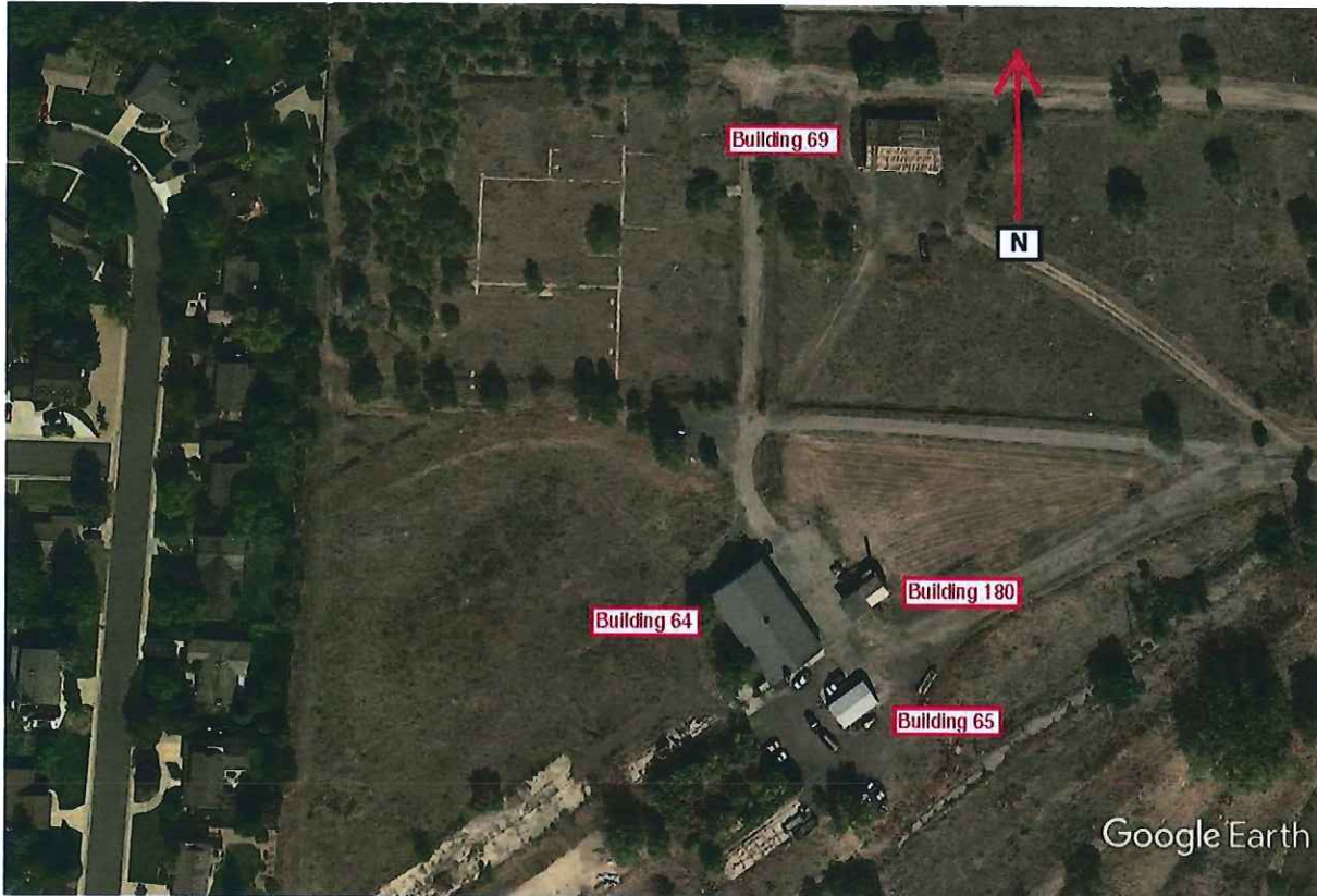
Attachment E (Figure 1) – Overview of Buildings in Project Site