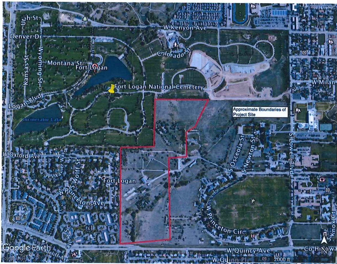
Attachment A – Fort Logan National Cemetery and Project Site