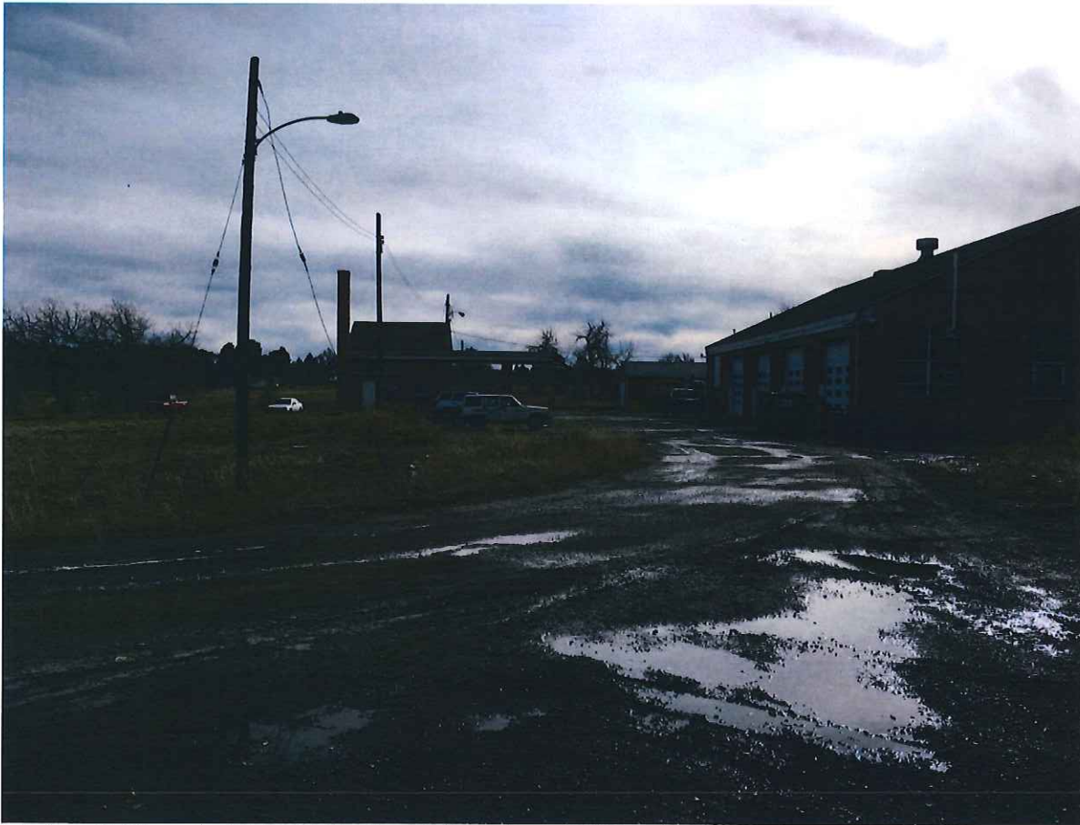
Attachment E (Figure 5) – 5DV.9371 (Combined Filling station and Oil House) looking south